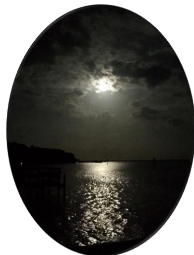
"Full Moon Rise on Ochlockonee Bay" by M.R. Street © 2020

M.R. Street, MPH, MSI (she/her) Editor Turtle Cove Press